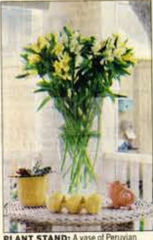
PLANT STAND: A vase of Peruvian lilies fooms large over an Easter-colored grouping of small ceramic planters.